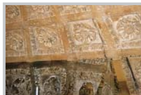
Musée d'art et d'histoire, St. Denis