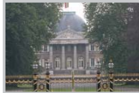
Royale Palace, Brussels