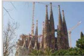
Sagrada Familia, Barcelona