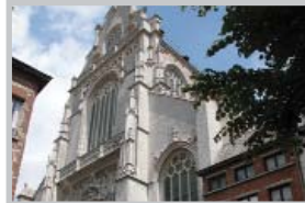
St. Paul's Church, Antwerp