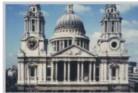
St. Paul's Cathedral, London